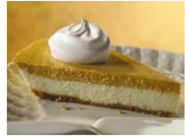
Double Layer Pumpkin Cheesecake